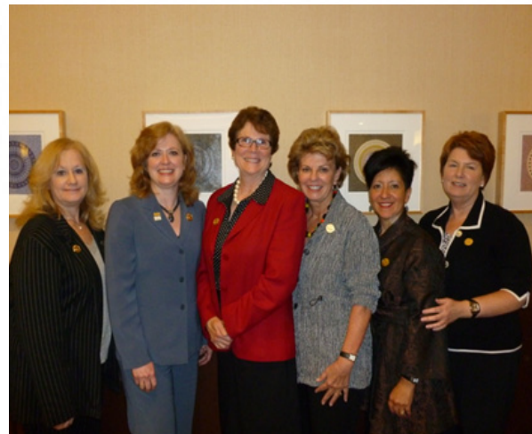
ENF Alumni at NE Regional Meeting May 2012

Please note that in order to have all job announcements we receive be readily available we now post job opportunities as we receive them to my.executivenursefellows.org .