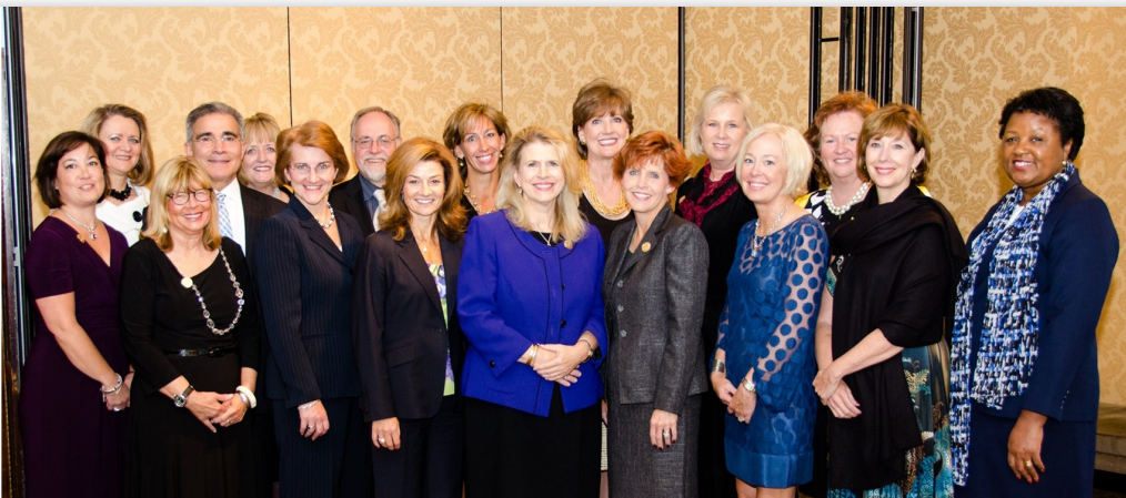
2009 Graduating Cohort, September 2012